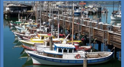
Fisherman's Wharf, San Francisco taken from Scoma's restaurant

with the location and any other information you would like to share and we'll feature it in an edition of Retiree Times . It may inspire others to go there! Here's one of mine.